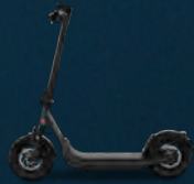
Egret X prime