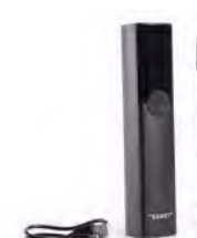
Smart Air Pump