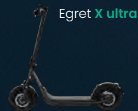
Egret X ultra