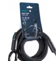
Egret mate by tex—lock