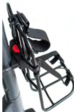
Caddy Oversize by Klickfix