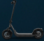
Egret X core