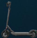
Egret Pro FX