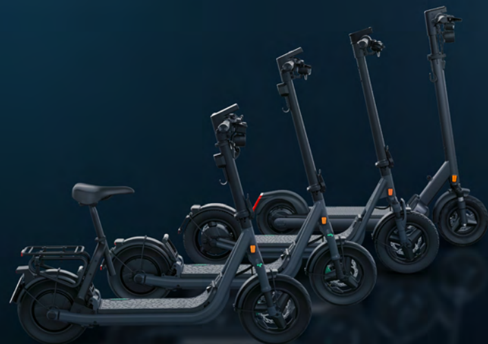
Egret Original 100 % construction by Egret in Germany