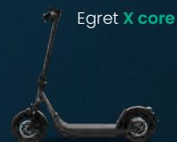
Egret X core