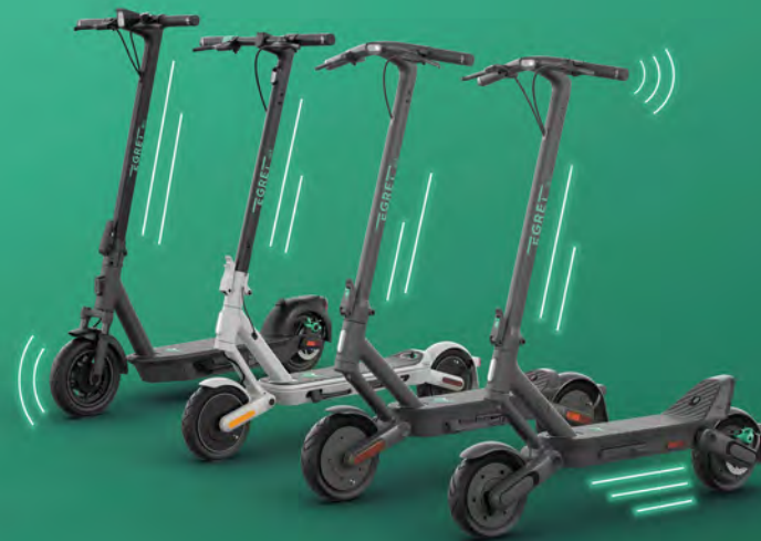
Egret Ey! Co-construction with premium partners