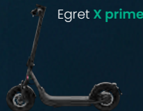
Egret X prime